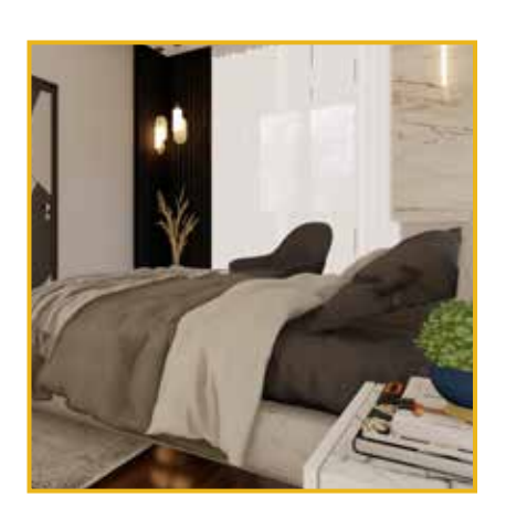
BEDROOM -2 AREA: 9'-2" X 11'