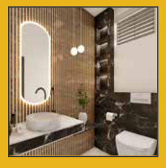
ATTACHED BATHROOM -1 AREA: 4'3" x 11'-2"