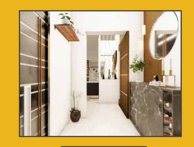
SERVICE AREA AREA: 8' x 3'