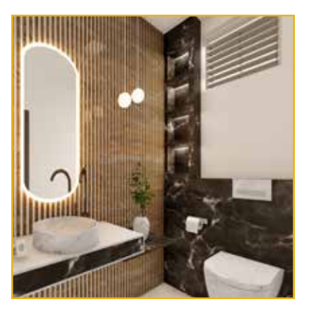
ATTACHED BATHROOM -1