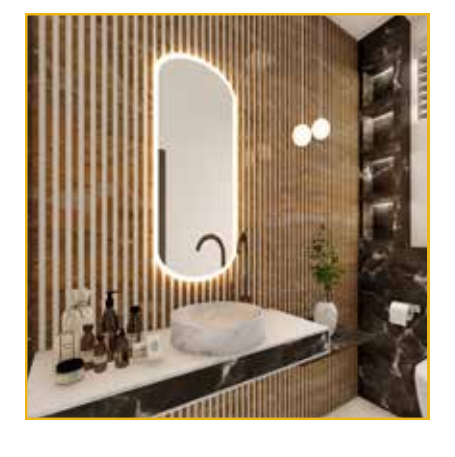
ATTACHED BATHROOM -1