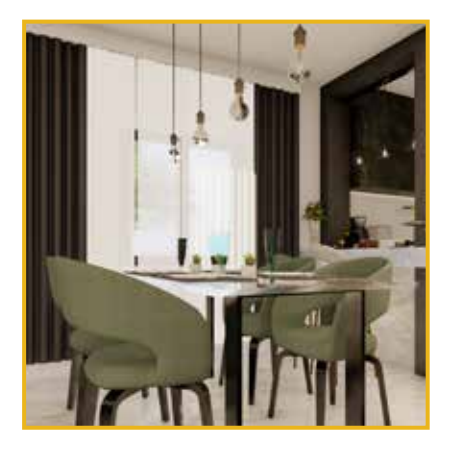
DINNING AREA: 14'2" X 6'-8"