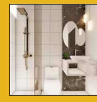
ATTACHED BATHROOM -2 AREA: 6'-8" x 4'-6"