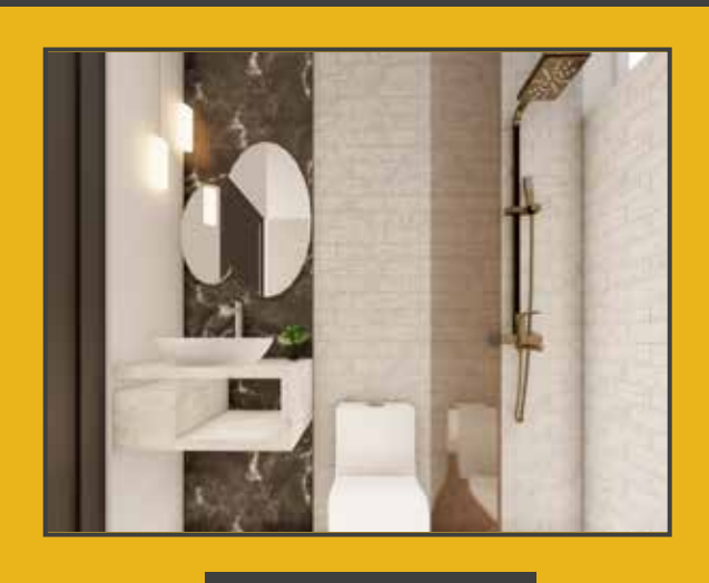
COMMON BATHROOM AREA: 8' x 4'