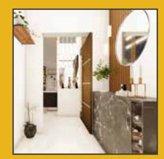
SERVICE AREA AREA: 8' x 4'-1.5"